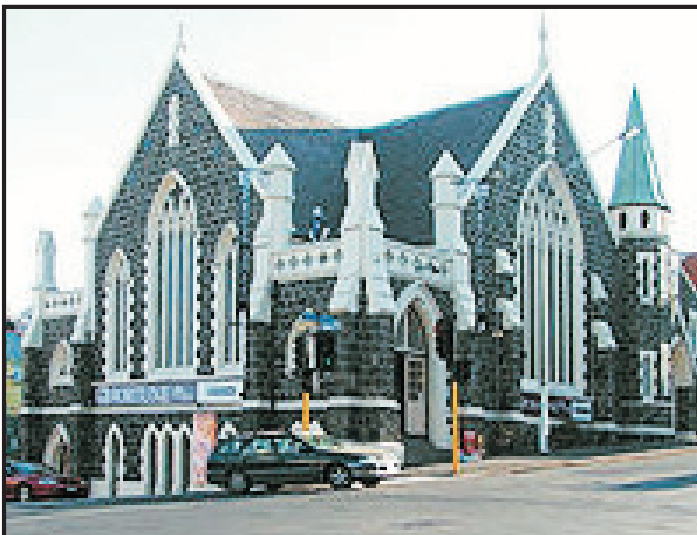
Theater-goers frequenting the Fortune Theater in Dunedin, New Zealand, are being enlightened by Ecoglo's convincing performances.

He discovered in Ecoglo a cost-effective path-finding solution that guided patrons to and from their seats, was unobtrusive to performers and cost-effective to install. "We didn't want a solution that would detract from the charm of the theater or distract performers or patrons," he says. Fortune Theater has also installed Ecoglo in the entryway to its auditoriums.