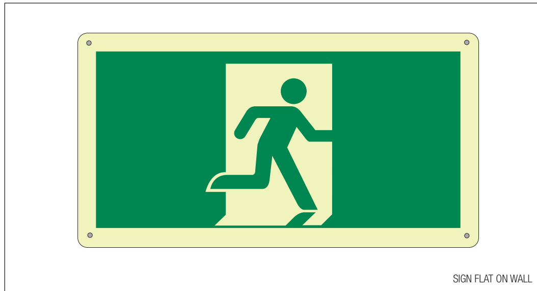
SIGN FLAT ON WALL